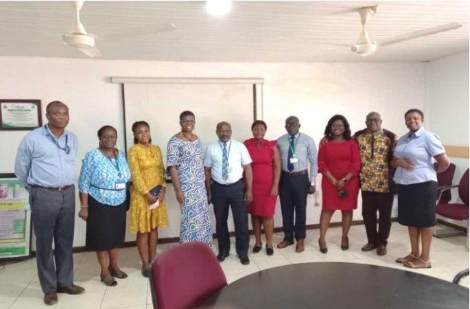
Accra City Tour with Oncology Interns

Two batches of pharmacists have undergone the two-month internship in handling of chemotherapy medications. The first batch were made up one pharmacist from Greater Accra Regional Hospital and one from Tamale Teaching Hospital. The second batch comprised a pharmacist from Liberia and another from Sierra Leone. This second batch was joined by a pharmacist from Ho Teaching Hospital. The programme was sponsored by World Child Cancer.