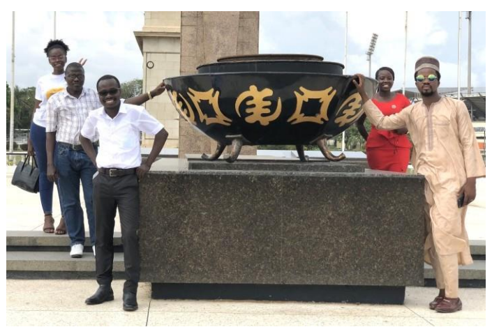
Accra City Tour with Oncology Interns