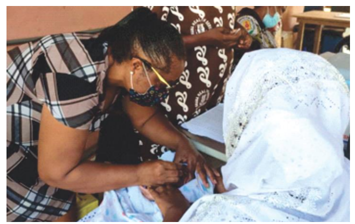
Hands-on Vaccination Training for Pharmacists

The training of Pharmacists Vaccinators was started in collaboration with the PSGH. An initial 80 pharmacists were taken through the conceptual training. About 70 pharmacists are currently involved in the hands-on training at various levels of completion. The College is in discussion with PATH to support the training of other pharmacists as Vaccinators.