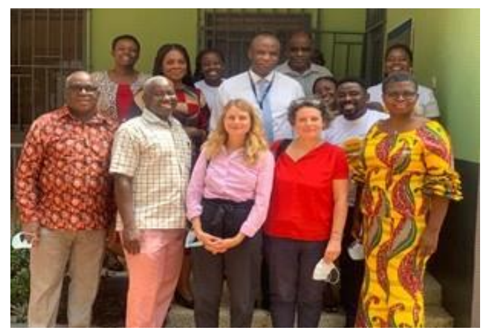
Meeting with representatives of the World Child Cancer

The training for Paediatric Oncology Pharmacists is ongoing. The candidates are currently undertaking their second session of the residency training. We are currently in discussions on potential sites for externships. Due to budgetary constraints the sites will all be located in Africa.