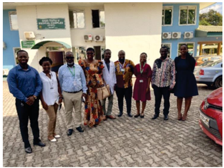
A group picture of residents and staff of KNUST Hospital